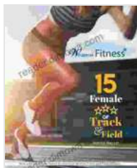
Image Alt: Wilma Rudolph, a trailblazing sprinter, overcame polio to win three gold medals at the 1960 Olympics.

In this comprehensive guide, we embark on a journey to discover the remarkable stories of 15 female trailblazers who have left an enduring legacy on the track and field arena. These dynamic stars, each with their unique talents and challenges, have pushed the limits of human performance while inspiring countless women and girls to reach for their dreams.