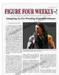
Figure Four Weekly #1024, Feb. 6, 2024 -- Eulogizing the end of the PWI Almanac by Ash Lingam

Rest in peace, Bill Apter. Your legacy will live on.