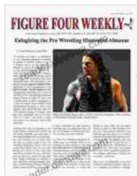
Figure Four Weekly #1024, Feb. 6, 2024 -- Eulogizing the end of the PWI Almanac by Ash Lingam